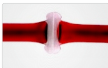
Seal with clear break line for snap-apart separation

Safety features & monitoring system makes it an ideal choice of users.