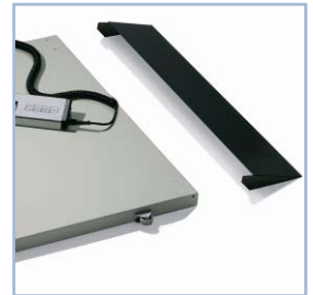
2 nd ramp MZ30010