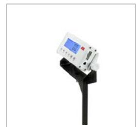
Foldable column M500660-01