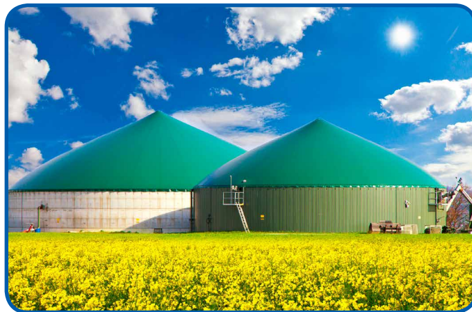
Fig. 1: After wastewater sludge, both pastoral and arable farms contribute significantly to biogas feedstock supplies in the United Kingdom.

Nevertheless it is farming that is the second largest feedstock contributor currently within the UK. Of course manure is prevalent throughout pastoral farming but notwithstanding, it is arable farming that contributes significantly to biomass stock, whether in the form of spoiled fruit and vegetables or (more so) from wheat crops such as maize that is deliberately grown as fuel. In fact, 17% of the maize crop grown in the United Kingdom in