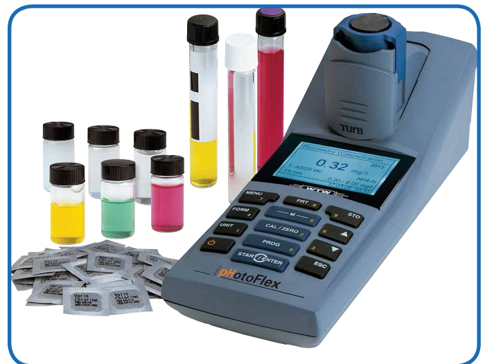
Fig. 3: The pHotoFlex TURB is capable of providing pH, COD, turbidity and ammonia readings from a single handheld meter.

Although the pHotoFlex offers great versatility for monitoring both process and environmental parameters, without doubt the most important measurement within the process itself is the FOS/TAC or alkalinity ratio; an ongoing indicator of the bio-fermenters stability based on Volatile Fatty Acids content (FOS) and buffer capacity (TAC) that prevents acidification in the reactor.