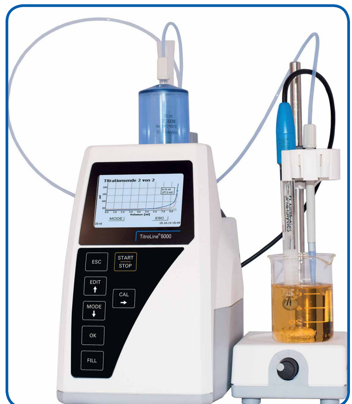
Fig. 4: SI Analytics TitroLine® 5000 auto-titrator with integral FOS/TAC method provides a simple means of monitoring a fermenter's stability so that catastrophic failure may be avoided.