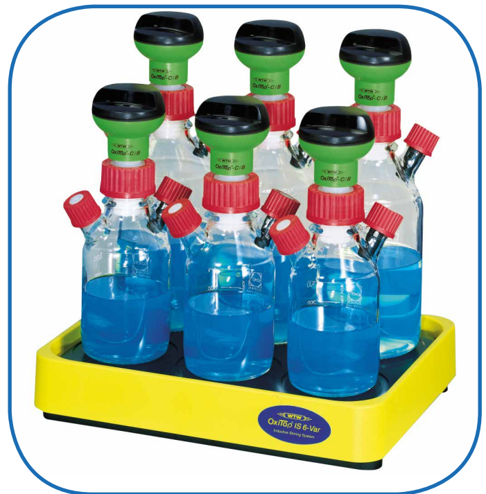
Fig. 5: OxiTop® C/D measuring heads are specifically designed to withstand corrosive hydrogen sulphide gases and provide a means of emulating the fermenter's performance.

It goes without saying though, that plant continuation represents the most important in terms of yield and profit as, if the bio-reaction fails, the costs and time involved to restart will not only have a detrimental effect on that particular fermentation, it will also directly affect the entire site's overall profit generated during any other active run. As such, continuous measuring of FOS/TAC is the most important measurement to be considered for local analysis at the biogas plant.