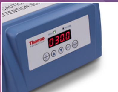
Digital Dry Bath / Block Heater pg 3

Available with digital or touch screen controls, our units provide outstanding temperature uniformity and stability that help create the reproducible results that you need.