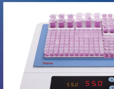
Compact Dry Bath / Block Heater pg 6