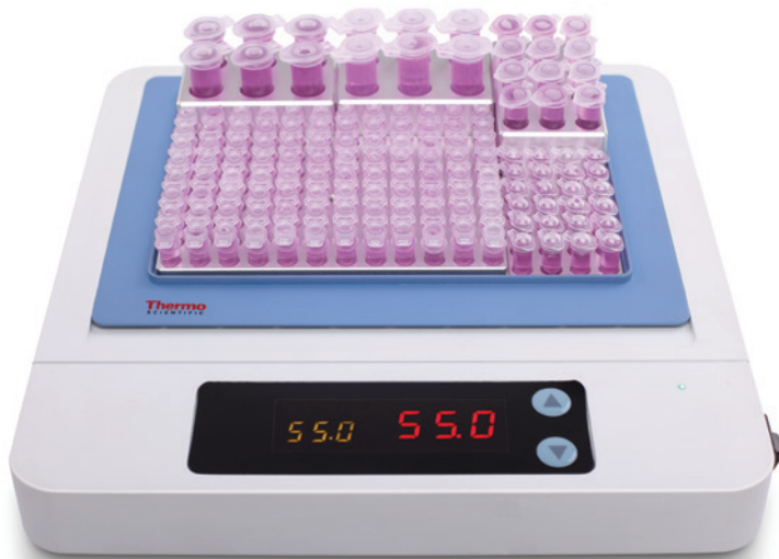
Small footprint and lightweight