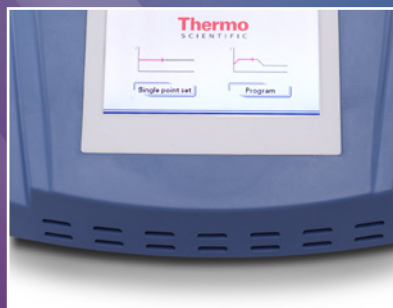
Touch Screen Dry Bath / Block Heater pg 4