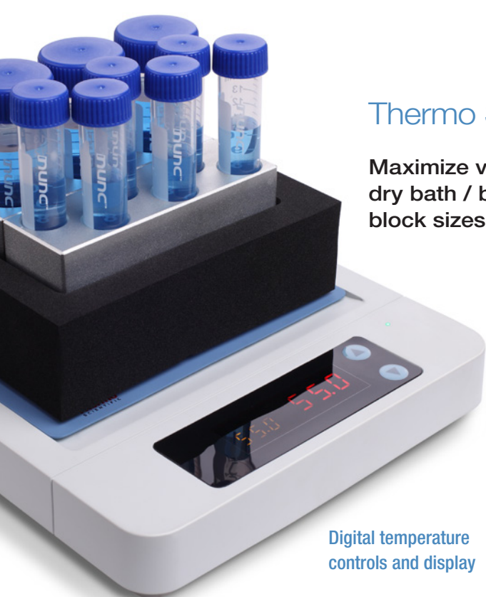
Digital temperature controls and display