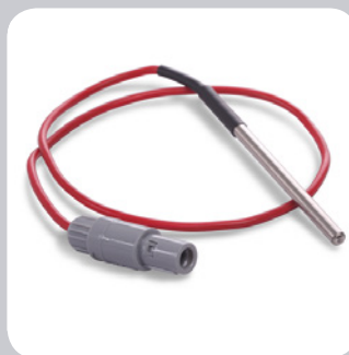
Optional PT 1000 temperature probe

Ordering Information and Specifications*